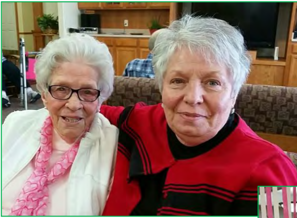
The snow didn't stop us from having a great time at our Sweetheart's Dance!