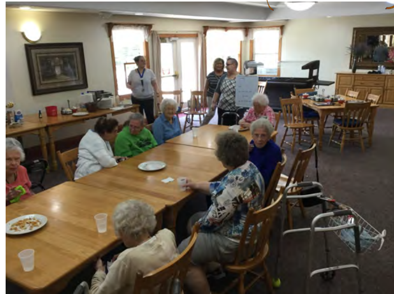
Above and to the left: Some of the ladies enjoyed making funnel cakes during Cooking Club. We had a plethora of toppings to choose from and nobody's belly went empty.