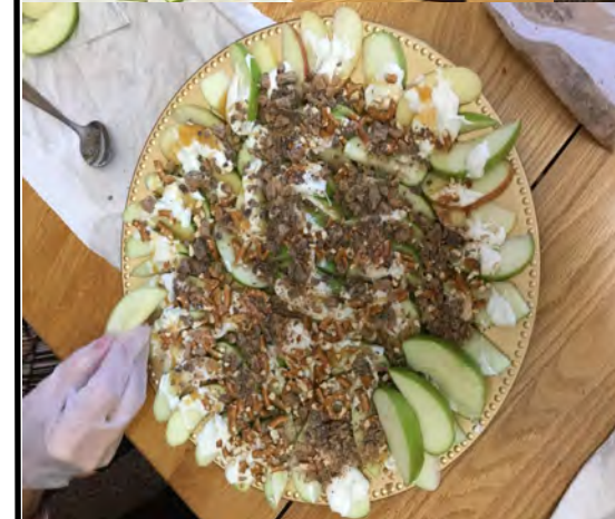
Bottom left: Our almost finished Apple Nachos. They were something new but the residents had a lot of fun making them.